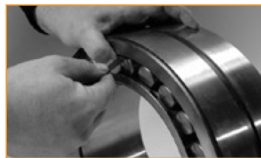
Figure 4 Radial internal clearance